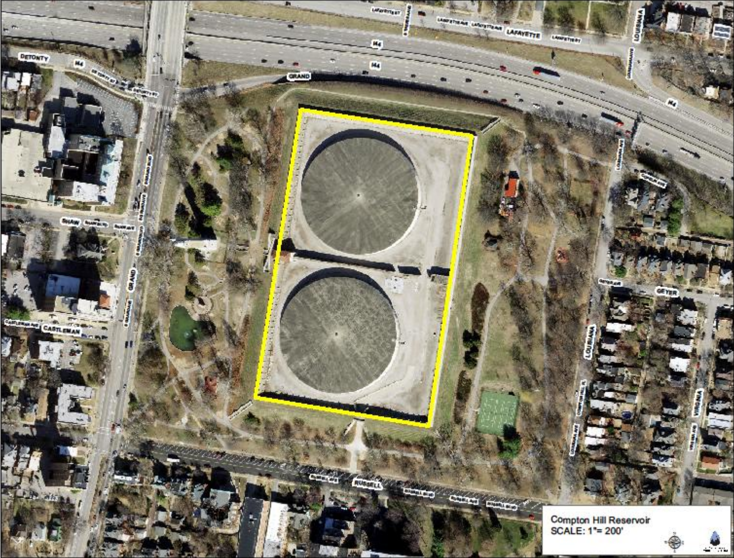
Compton Hill Reservoir SCALE: 1"= 200'